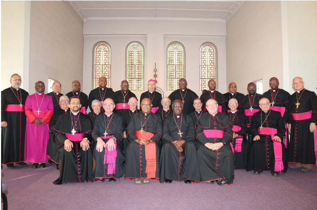
Catholic Bishops of Southern Africa

New and dangerous tensions are arising as the ruling party storms through a period of transition. The Southern African Catholic Bishops' Conference calls on all engaged in political decisions regarding in particular the future role of President Zuma to exercise calm and patience.