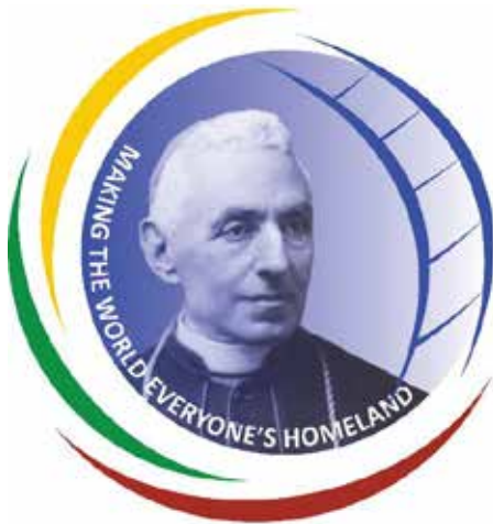
Scalabrini father to the Migrants